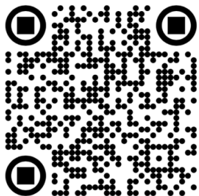
Experienced PR Member Contact Form